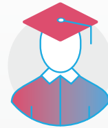
Improved Learner Experience